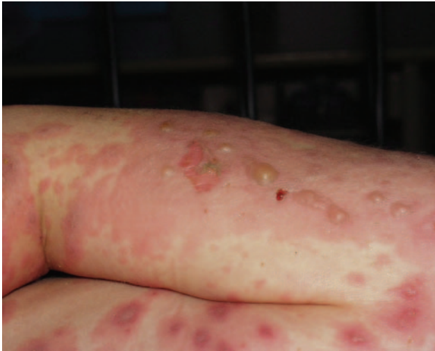
FIGURE 2 Typical pattern of SJS: blisters develop on widespread atypical targets.

mines were modestly increased, but the lower confidence limits were <1.0 .