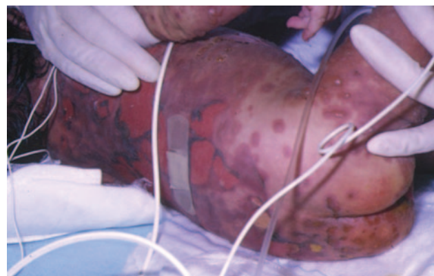
FIGURE 1 Typical pattern of TEN: skin detachment and atypical targets.

Sulfonamides, phenobarbital, carbamazepine, and lamotrigine were never concomitant to another highly suspected drug.